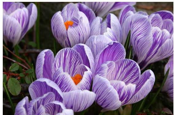
Spring Arrives early in the Fraser Valley

As APICS in the Fraser Valley progresses through our second year, several of our board members will not be seeking re-election this upcoming term. As a result we will be actively looking for new nominations to the board in order to continue providing service to the Fraser Valley. For more information about nominations please see Page 5 for details.